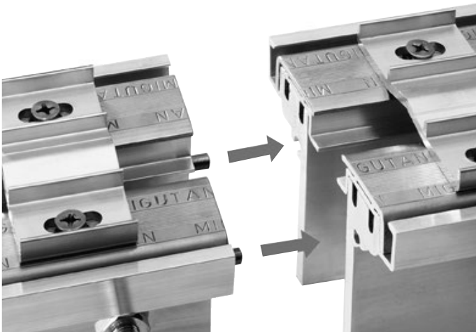
Example FP 90/90 B NI